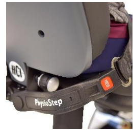
Seat Belt PS-SB