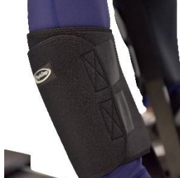
Leg Stabilizer PS-LS