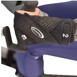
Hand Grip PS-HG